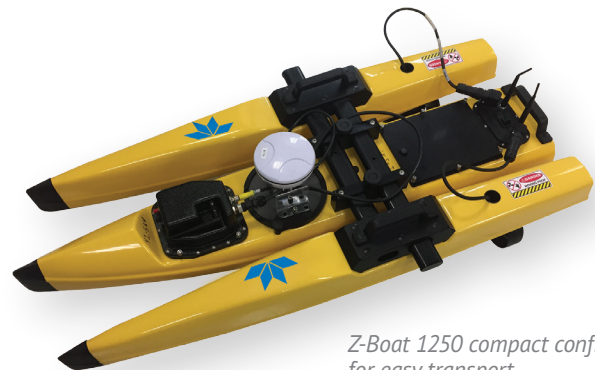
Z-Boat 1250 compact configuration for easy transport