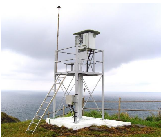
The SM-050 at Gosan, South-Korea.

The radar observes the ocean surface in a semi-circle at a distance of 180 – 450 m depending on the installation height, typically 25 – 80 m.