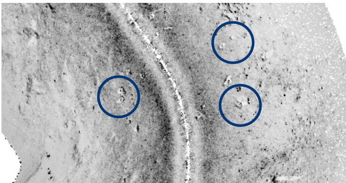
GeoSwath Plus Compact 500 kHz geo-referenced side scan data collected in 5 m water depth in a Kleipeda port, showing debris including car tires.

In addition to wide swath bathymetry data GeoSwath Plus Compact simultaneously acquires real geo-referenced side scan data . Particularly in shallow water environments both surveys can be accomplished simultaneously without the need for a towed side scan, which can be operationally challenging.