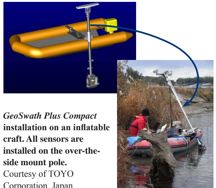
GeoSwath Plus Compact installation on an inflatable craft. All sensors are installed on the over-the-side mount pole.