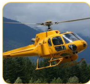
Flight Test Instrumentation

This standalone AHRS solution is designed for avionics retrofit and OEM aircraft applications. The AHRS500CA is available in several different configurations that provide the flexibility to accommodate various system interfaces, and typical mounting orientation and installation location requirements.