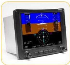
Primary Flight Display Systems